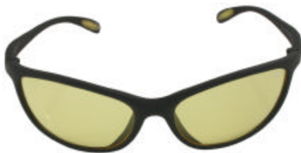
RAZ120 Nylon Black Frame with Yellow Lens UPC 859741000295