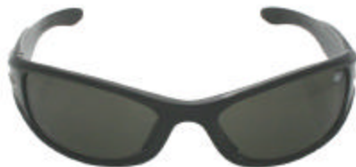
KOD110 Shiny Black Frame with Grey Lens UPC 859741000646