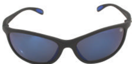
RAZ175 Nylon Black Frame with Dark Blue Mirror Lens UPC 859741000318