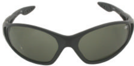
PAN110 Matte Black Frame with Grey Lens UPC 859741000226