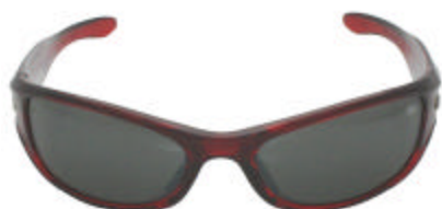
KOD740 Crystal Red Frame with Grey Mirror Lens UPC 859741000691