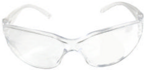
INT000 Clear Frame and Lens UPC 859741000486