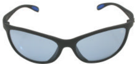
RAZ170 Nylon Black Frame with Light Blue Mirror Lens UPC 859741000479