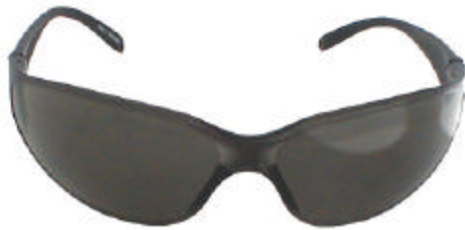
INT010 Grey Frame and Lens UPC 859741000547