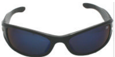
KOD175 Shiny Black Frame with Dark Blue Mirror Lens UPC 859741000653