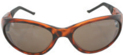
SPY560 Tortoise Frame with Brown Mirror Lens UPC 859741000202