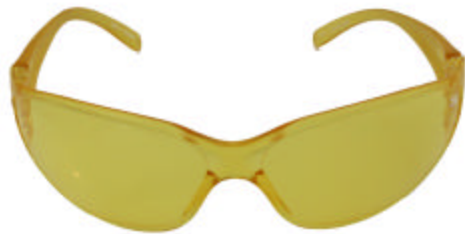
INT020 Yellow Frame and Lens UPC 859741000493