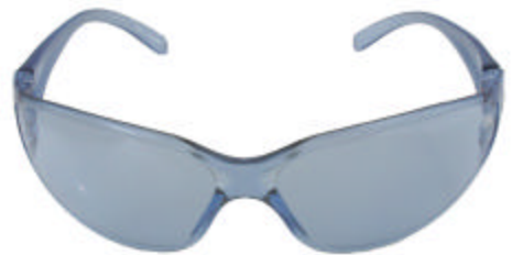
INT070 Light Blue Frame and Lens UPC 859741000509