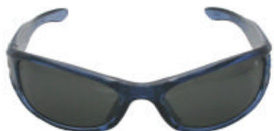
KOD440 Crystal Blue Frame with Grey Mirror Lens UPC 859741000660