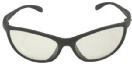
RAZ100 Nylon Black Frame with Clear Lens UPC 859741000271