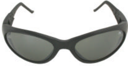
SPY110 Matte Black Frame with Grey Lens UPC 859741000158