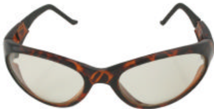
SPY500 Tortoise Frame with Clear Lens UPC 859741000189