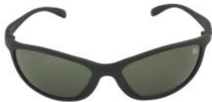
RAZ110 Nylon Black Frame with Grey Lens UPC 859741000288