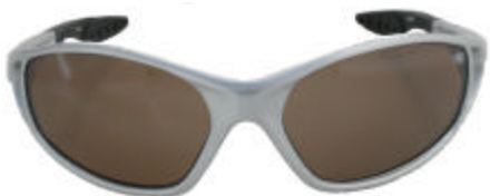
PAN660 Shiny Silver Frame with Brown Mirror Lens UPC 859741000257