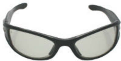
KOD100 Shiny Black Frame with Clear Lens UPC 859741000639