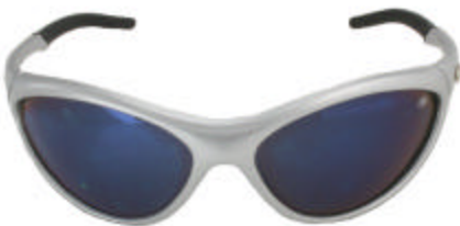
APA675 Shiny Silver Frame with Dark Blue Mirror Lens UPC 859741000561