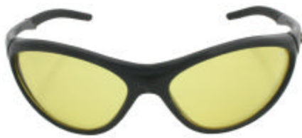
APA120 Shiny Black Frame with Yellow Lens UPC 859741000530