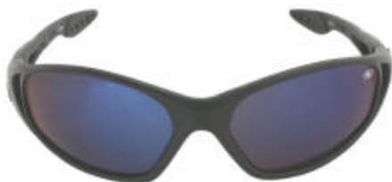
PAN175 Matte Black Frame with Dark Blue Mirror Lens UPC 859741000240