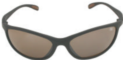
RAZ160 Nylon Black Frame with Brown Mirror Lens UPC 859741000301