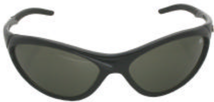
APA110 Shiny Black Frame with Grey Lens UPC 859741000523