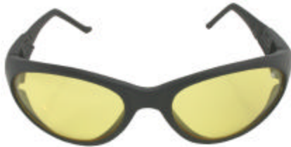
SPY120 Matte Black Frame with Yellow Lens UPC 859741000165