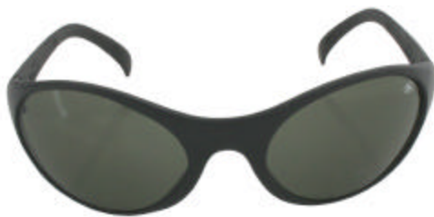
SUN110 Matte Black Frame with Grey Lens UPC 859741000110