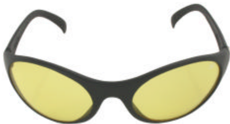
SUN120 Matte Black Frame with Yellow Lens UPC 859741000127