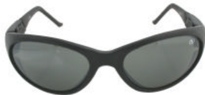
SPY140 Matte Black Frame with Grey Mirror Lens UPC 859741000172