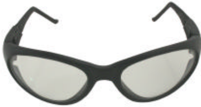
SPY100 Matte Black Frame with Clear Lens UPC 859741000141