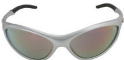
APA685 Shiny Silver Frame with Orange Mirror Lens UPC 859741000578