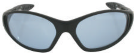
PAN170 Matte Black Frame with Light Blue Mirror Lens UPC 859741000233