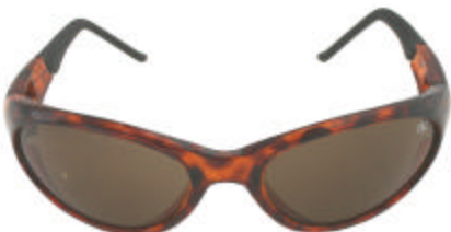
SPY550 Tortoise Frame with Brown Lens UPC 859741000196