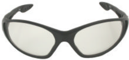
PAN100 Matte Black Frame with Clear Lens UPC 859741000219