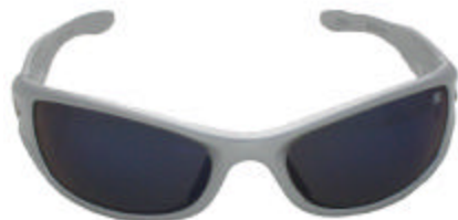
KOD675 Shiny Silver Frame with Dark Blue Mirror Lens UPC 859741000677