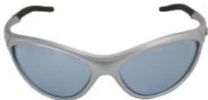
APA670 Shiny Silver Frame with Light Blue Mirror Lens UPC 859741000554