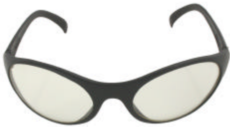
SUN100 Matte Black Frame with Clear Lens UPC 859741000103