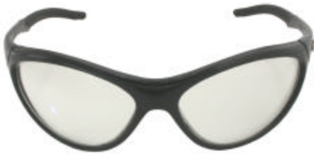
APA100 Shiny Black Frame with Clear Lens UPC 859741000516