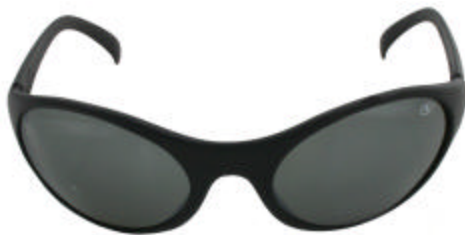
SUN140 Matte Black Frame with Grey Mirror Lens UPC 859741000134