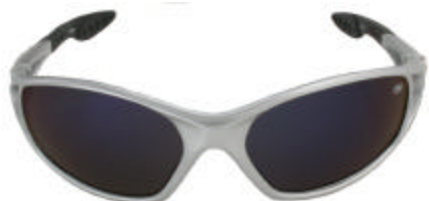
PAN675 Shiny Silver Frame with Dark Blue Mirror Lens UPC 859741000264