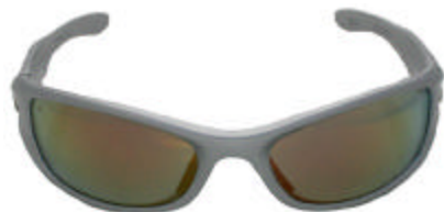
KOD685 Shiny Silver Frame with Dark Blue Mirror Lens UPC 859741000684